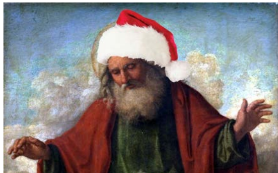
God as Santa Claus